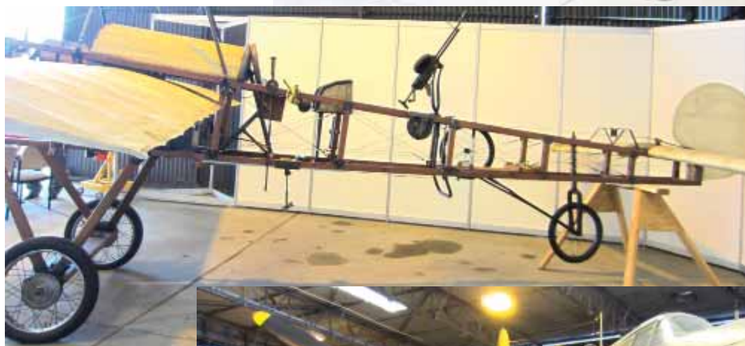
Don't you just love the seating position and where the gun is!