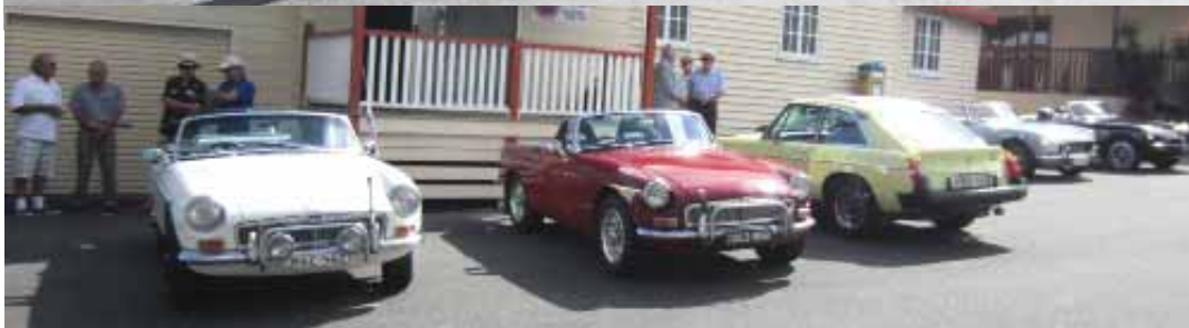
Meeting up at the Clubrooms