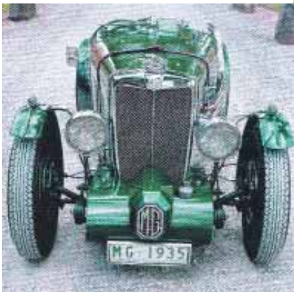
Left - Early view of Maisie without the roll bar