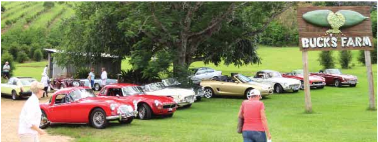
Morning Tea at Buck's Farm, Chillingham