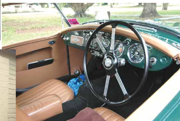
Roger took these two photos at our morning tea spot at Cunungra and the cover photo of 5 MGAs