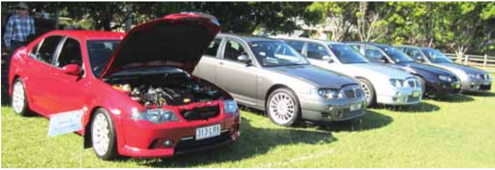
Members cars at the Nationals Concours