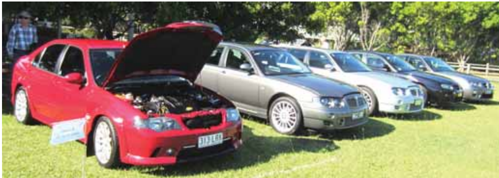
Members cars at the Nationals Concours