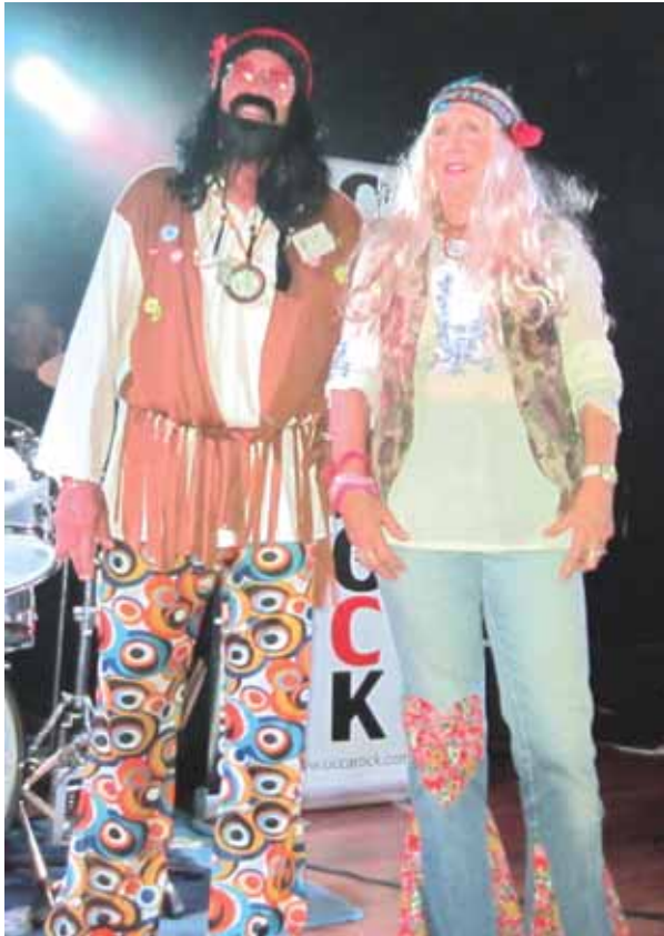
Some photos from the Theme Night, including the winners, left.